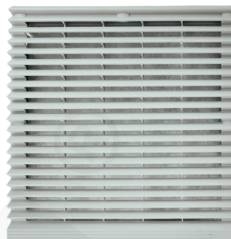
Wentylator z filtrem WRF 230/230, WRF 230/24